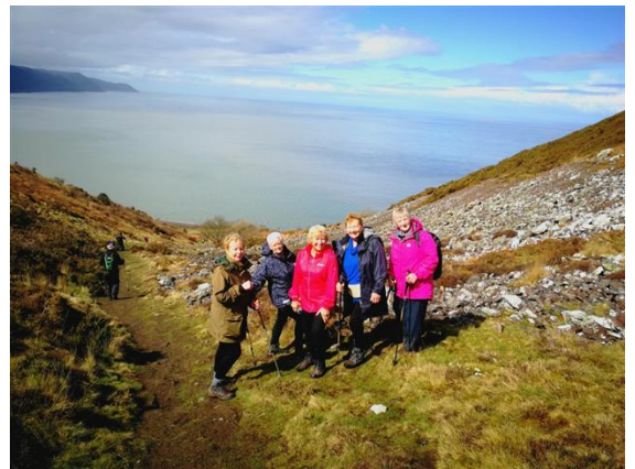
At the top of Hurlstone Point