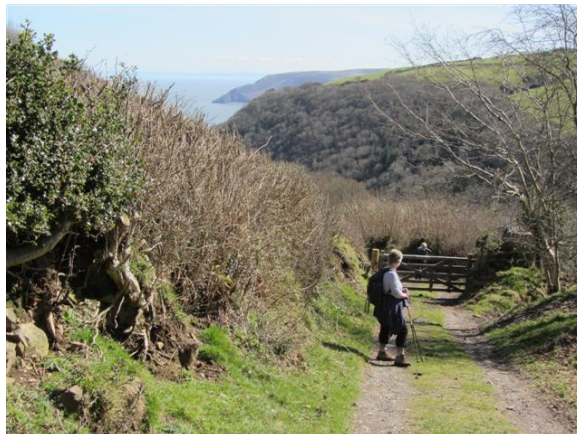
A look back along the coast