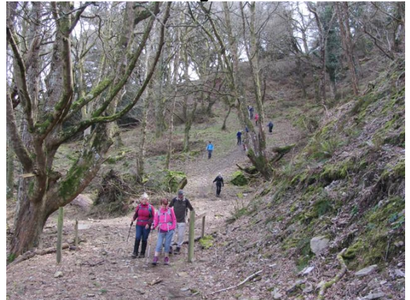
The steep climb down through the woods