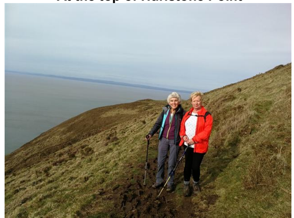
A path with a view