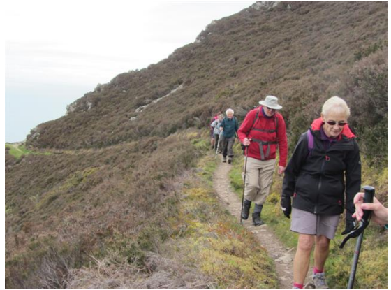
Yes, you did climb this way, you just couldn't see it!