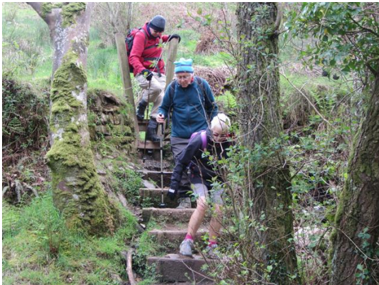
Crossing the stream at Sherrycombe