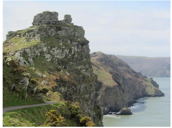
Valley of the Rocks