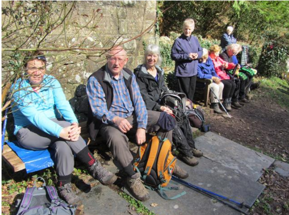
Coffee break in the sun