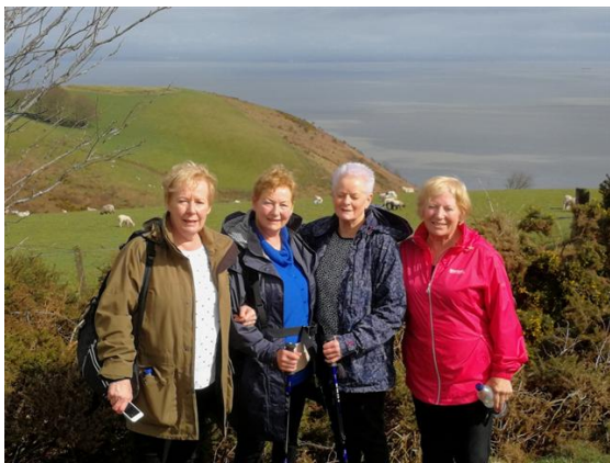
This is a good one for the album