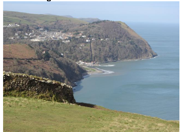
Lynmouth from the path at Countisbury