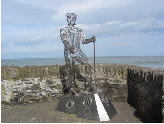
The Rambler statue at Lynmouth