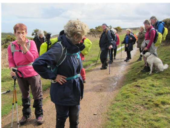
Waiting for the others to catch up