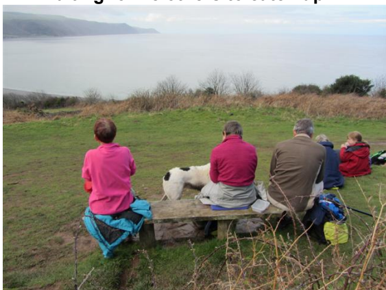
A lunch stop with a view over Porlock Beach