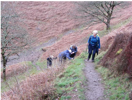
The first climb – without the runners