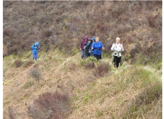
Walking down to Hunters Inn