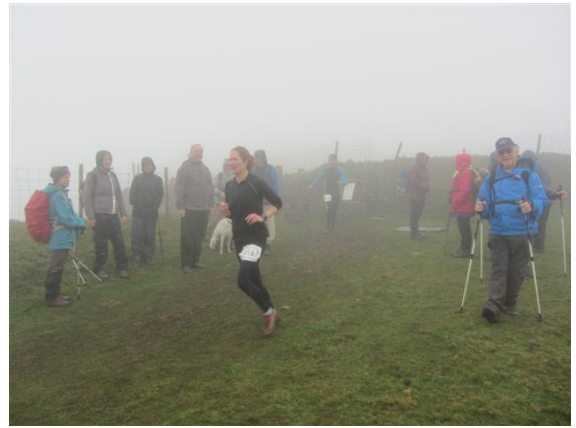
Runners- they must have been mad!!!!