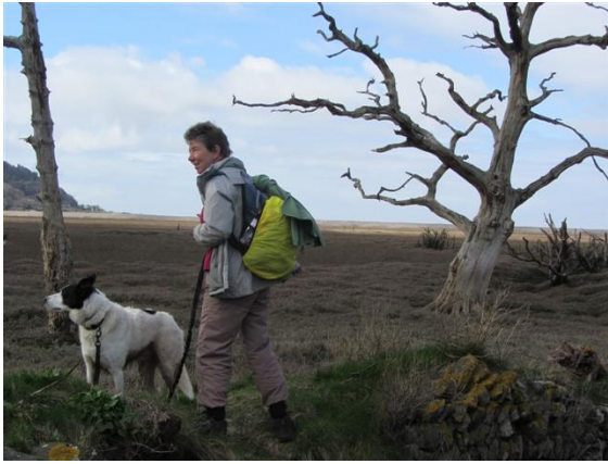
Trees a Porlock March