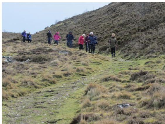
The descent down Hurlstone Point