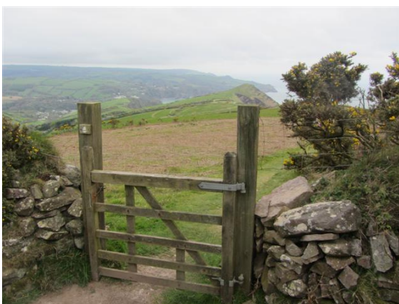
Looking down into Combe Martin