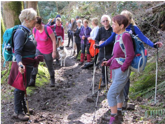
Heading for coffee break at Culbone Church