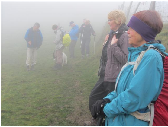
It was so misty and muddy at the top