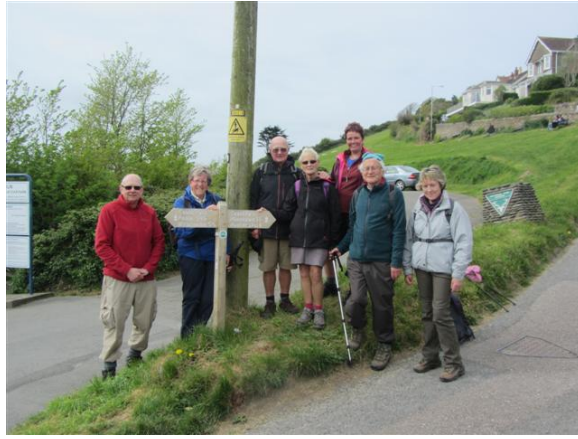
At Combe Martin and a photo stop at the signpost