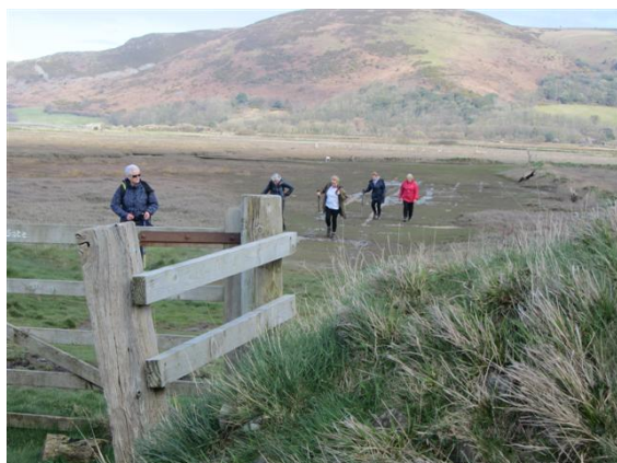
A view back across Porlock Marsh