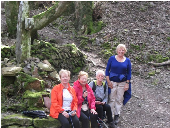
Four sisters at Seven Sisters Fountain