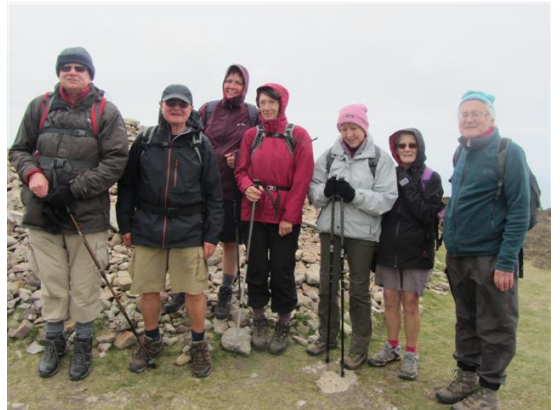
Great Hangman – it was so windy at the top!