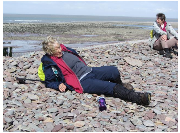
5 minutes to rest on Porlock Beach