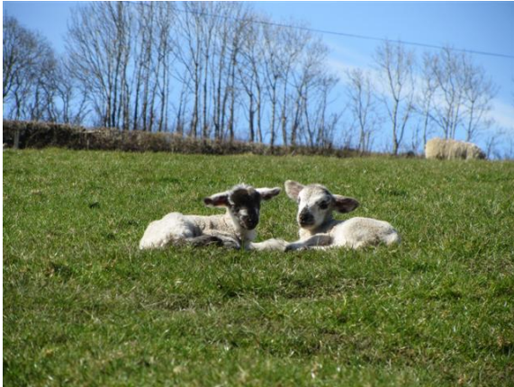
New born lambs near Silcombe Farm