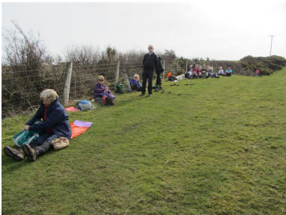
Lunch with a coastal view