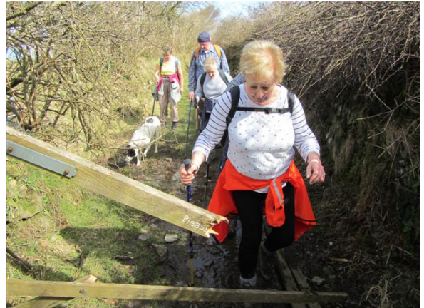
... then we had to negotiate a broken down gate