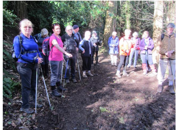
On our way up through the woods