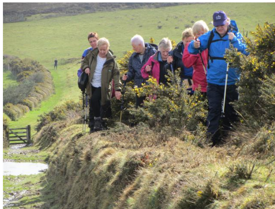
This was an interesting way to avoid the mud