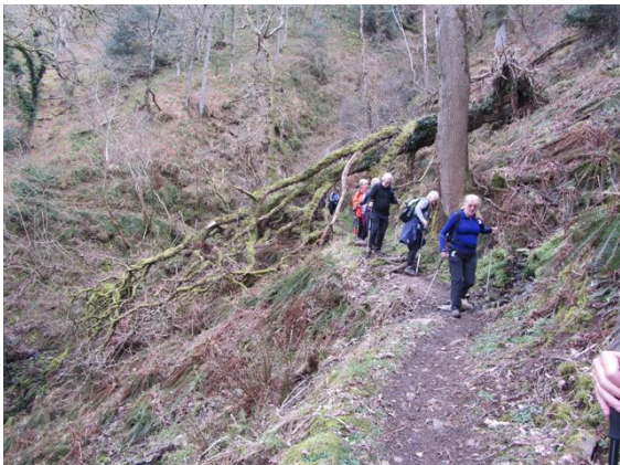
We climbed through the woods to Countisbury