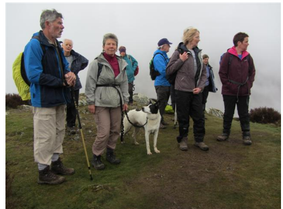
At the top with what should have been a view down into Heddon's Mouth