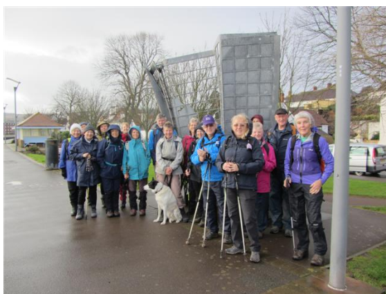
Team SWCP 2018

As promised here are some photographs for you.