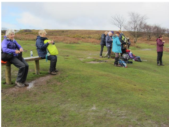
Coffee break at the top of North Hill