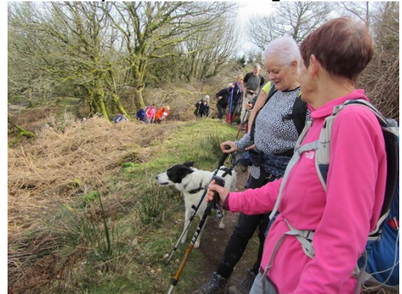
Looking down on the Glenthorne Estate