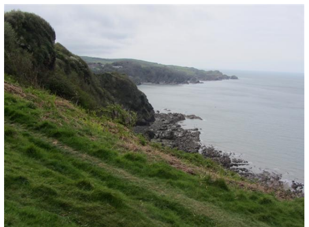
A view along the coast